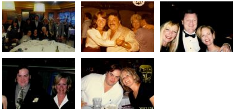
Volk Leber Funeral Home - June 22, 2023 at 01:16 PM

“ 54 files added to the album Life Tributes