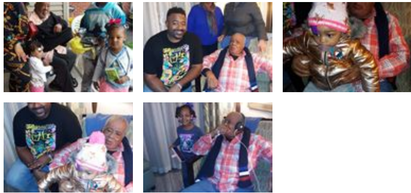
Volk Leber Funeral Home - January 21, 2021 at 12:48 PM

“ 146 files added to the album LifeTributes